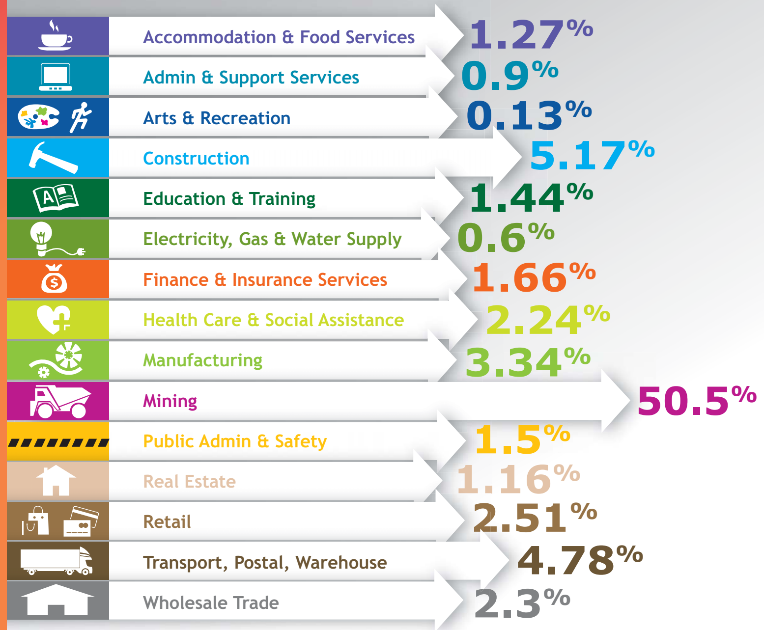
Mackay's Major Industries shown in percentages of the district economy

AS A TOURISM HUB, the Mackay region is also an event destination, including the popular annual yachting event, Hamilton Island Race Week, the annual Qantaslink River to Reef Festival, the multicultural festival - Global Grooves , and the Mackay Tinnie and Tackle Show.